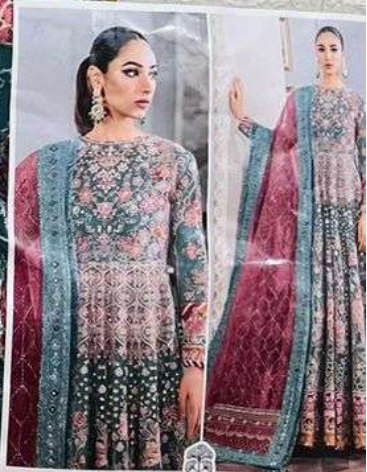
CHANTELLE ZAHA D.No. 10293 TOP Butterfly Net with Embroidery BOTTOM INNER Dull Satin DUPATTA Butterfly Net with Embroidery

USE 100% COTTON 100% SILK 100% WOOL 100% LINEN 100% COTTON