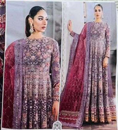
CHANTELLE ZAHA D.No.10293-E VOL. 5 TOP: Butterfly Net with Embroidery BOTTOM INNER: Dull Satin DUPATTA: Butterfly Net with Embroidery

USE INSTRUCTIONS * For more information * Visit our website * Call us at 020-26111111