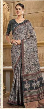
43713 Fabric - Gajji Silk