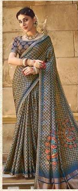
43705 Fabric - Gajji Silk