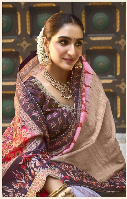
Gajras are popular for their pleasant fragrance, which is believed to have a calming effect on the mind.