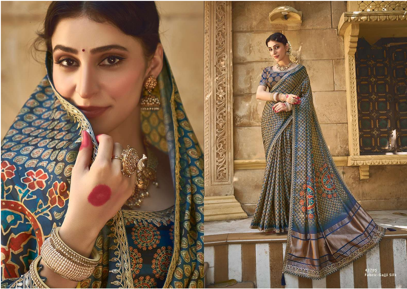
43705 Fabric-Gajji Silk