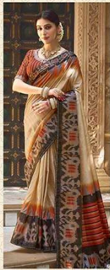
43709 Fabric - Bhagalpuri Silk