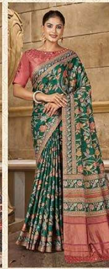
43718 Fabric - Gajji Silk