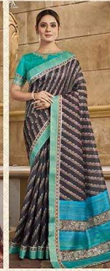
43715 Fabric - Gajji Silk