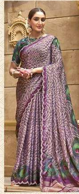
43712 Fabric - Gajji Silk