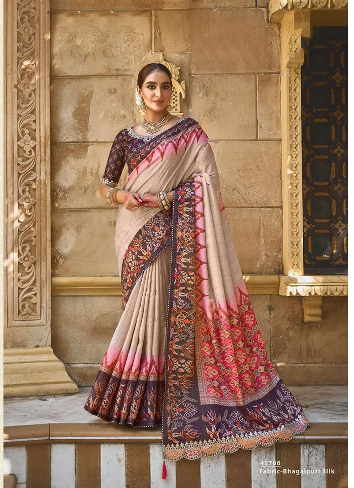
43706 Fabric-Bhagalpuri Silk