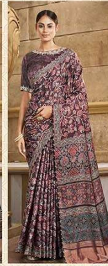
43714 Fabric - Gajji Silk