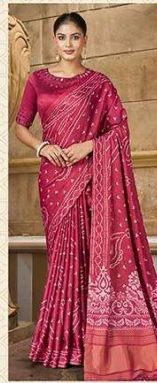
43716 Fabric - Gajji Silk