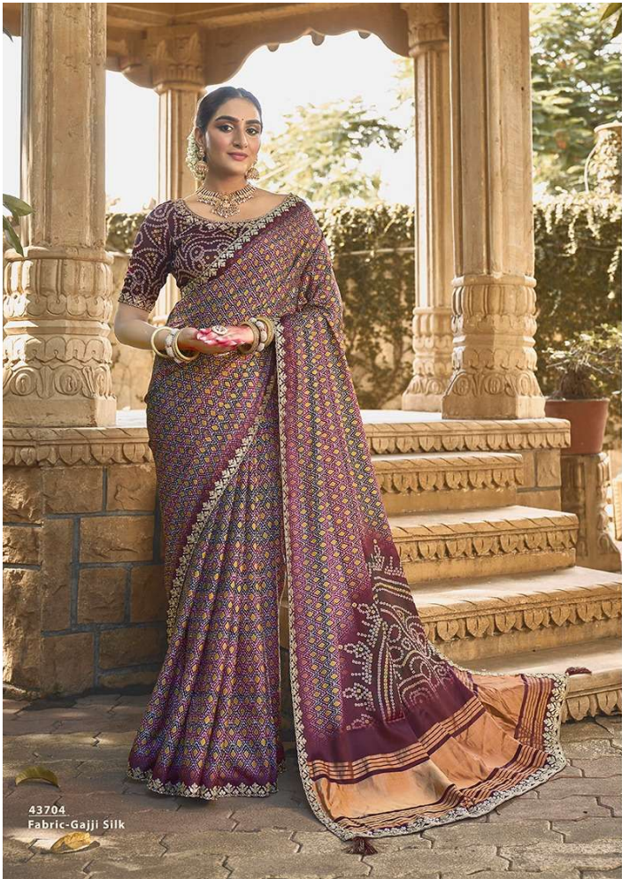
43704 Fabric-Gajji Silk