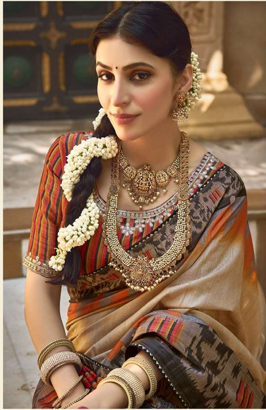
Reflecting beauty and grace in every look.