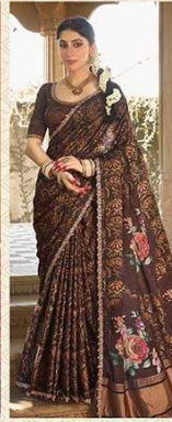
43707 Fabric - Gajji Silk