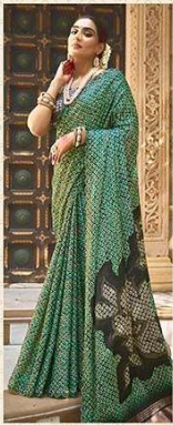
43708 Fabric - Gajji Silk