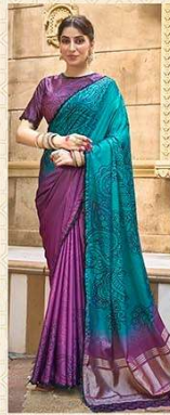
43710 Fabric - Gajji Silk