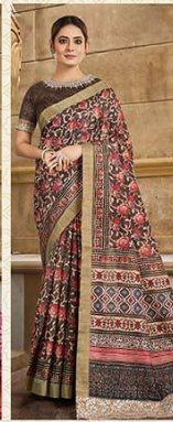
43717 Fabric - Gajji Silk