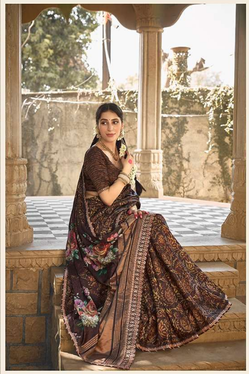
Gajra flowers are considered a symbol of love and are often gifted to loved ones as a gesture of affection.