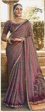
43704 Fabric - Gajji Silk