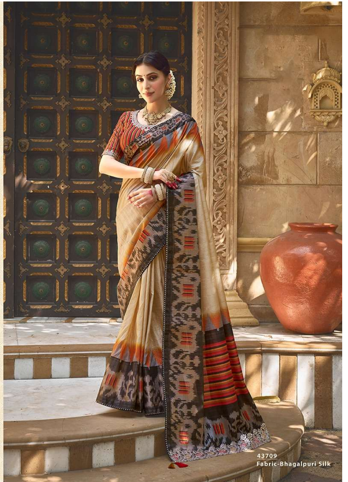
43709 Fabric-Bhagalpuri Silk