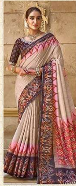
43706 Fabric - Bhagalpuri Silk