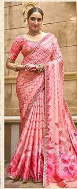
43711 Fabric - Gajji Silk