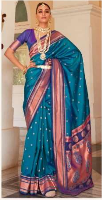
| 97001 |