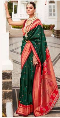
| 97008 |