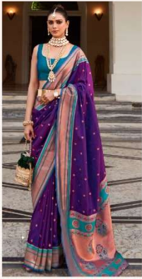
| 97006 |