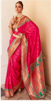
| 97002 |