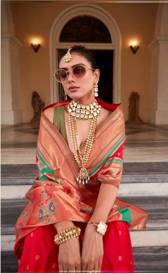
The fantasy ahead | 97004