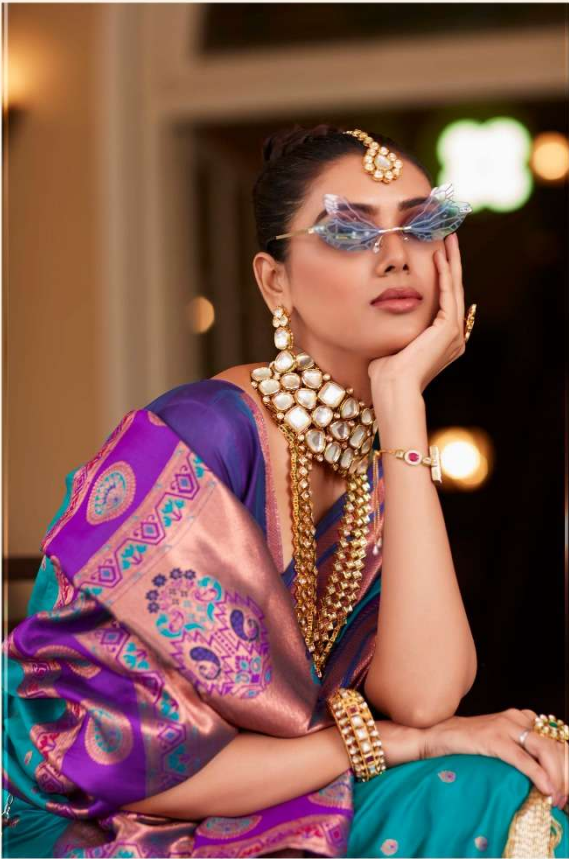
Statement Gorgeous | 97005