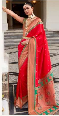
| 97004 |