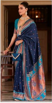
| 97003 |