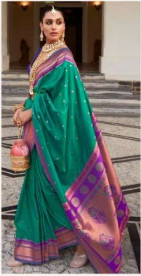
| 97007 |