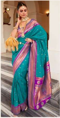
| 97005 |