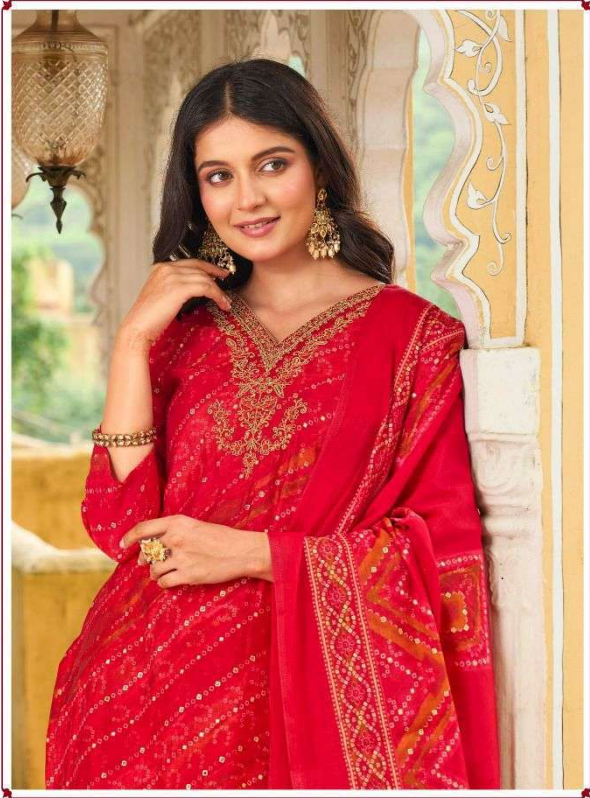
~. An essence of ethnicity.~