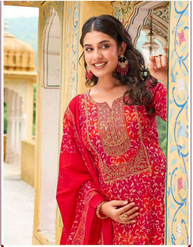
- . A medley of colours. . -