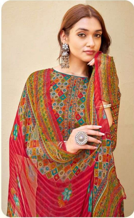
❀ D.No.1006 ❀