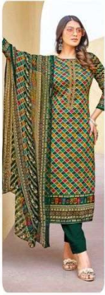
❁ D.No.1002 ❁