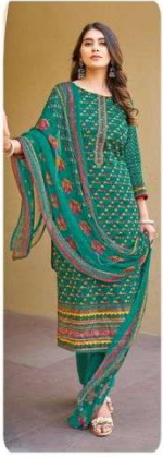
❁ D.No.1005 ❁