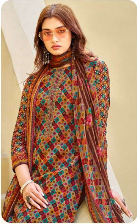
❀ D.No.1004 ❀