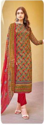
❁ D.No.1006 ❁