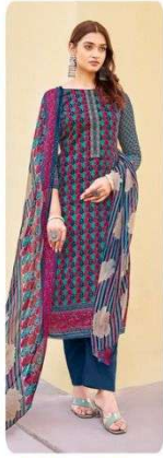
❁ D.No.1008 ❁