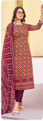
❁ D.No.1007 ❁