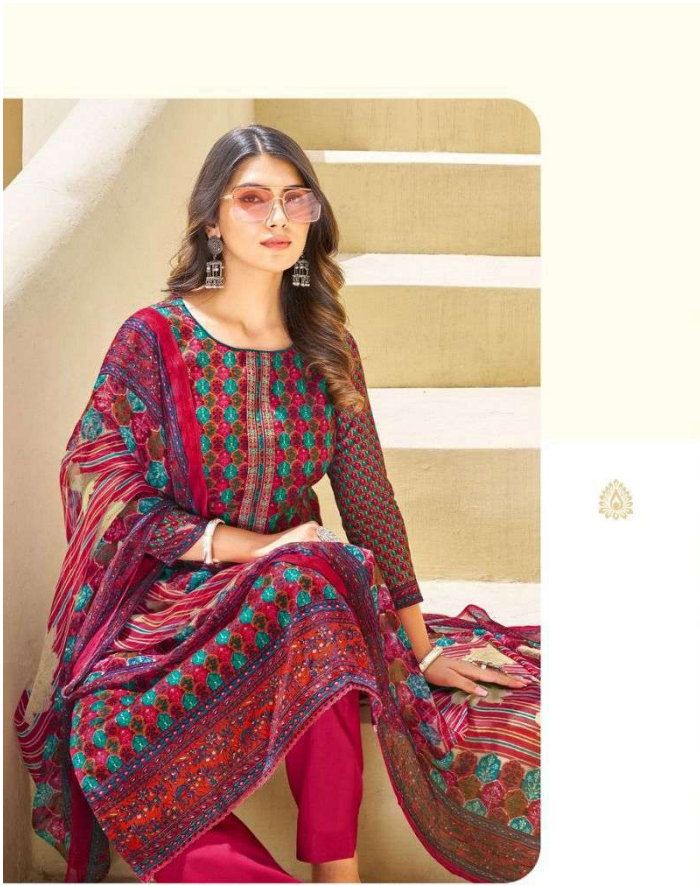
❁ D.No.1003 ❁ "Luxury Unveiled in Every Weave."