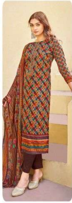
❁ D.No.1004 ❁