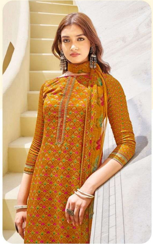
❀ D.No.1001 ❀