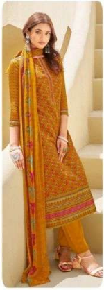
❁ D.No.1001 ❁