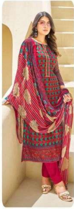
❁ D.No.1003 ❁