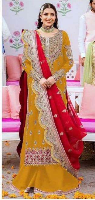
7773 D.No:-286 B