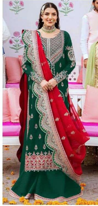
7773 D.No:-286 C