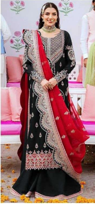
7773 D.No:-286 A

TOP- PURE FOX GEORGETTE WITH HEAVY EMBROIDERY AND SEQUENCE WORK BOTTOM/INNER- DULL SHANTOON DUPATTA- PURE FOX GEORGETTE FANCY DUPATTA AND HEAVY EMBROIDERY