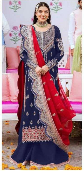
7773 D.No:-286 D