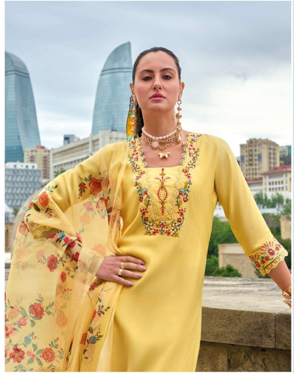
Mystic beauty Fashion is what you're offered four times a year by designers, and style is what you choose.