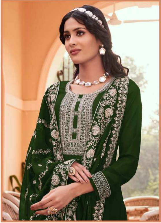
When it comes to adorn a stylish everyday look, this soothing shaded embroidery detailed sara is in ideal peak!