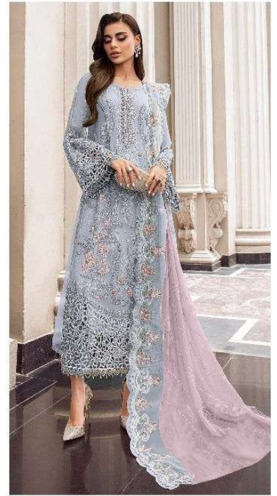
C - 1707 C