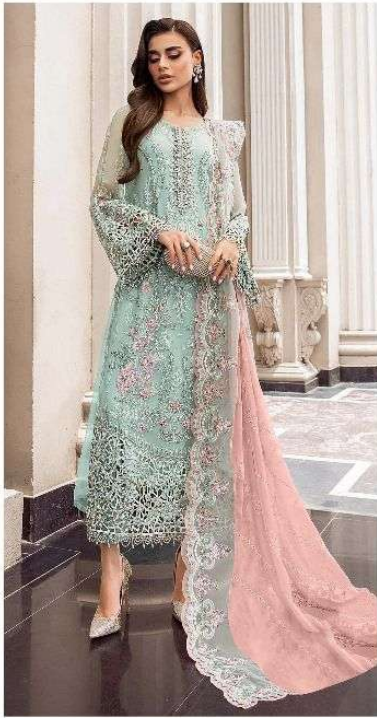
C - 1707