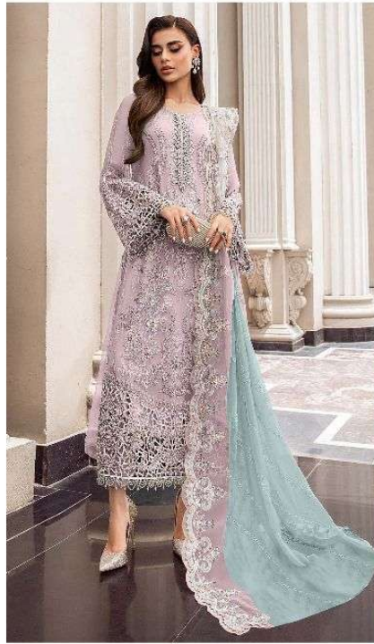
C - 1707 B