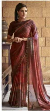
43008 FABRIC : SPARKING SATIN SILK CRUSH BLOUSE