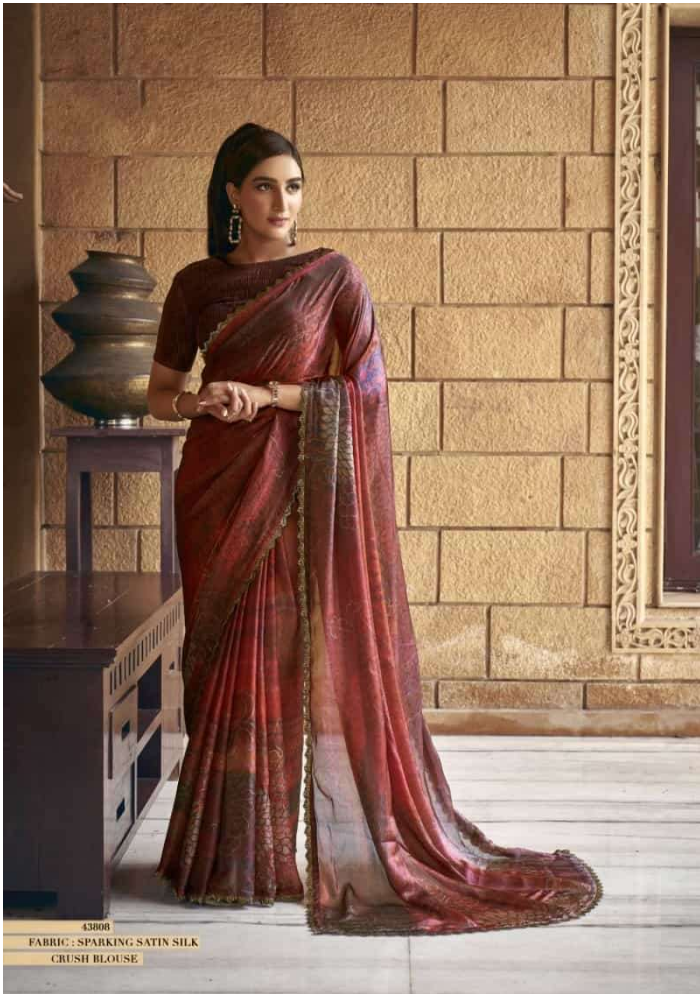
43908 FABRIC: SPARKING SATIN SILK CRUSH BLOUSE