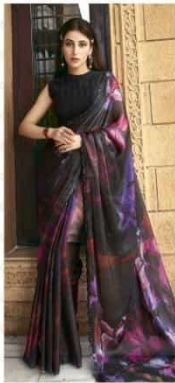
43003 FABRIC : SPARKING SATIN SILK CRUSH BLOUSE