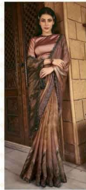
43010 FABRIC : SPARKING SATIN SILK