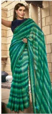
43007 FABRIC : SPARKING SATIN SILK CRUSH BLOUSE