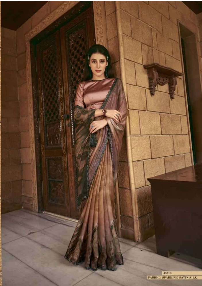
43810 FABRIC: SPARKING SATIN SILK