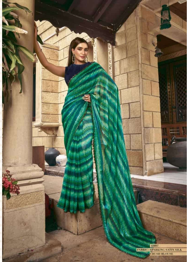
43807 FABRIC: SPARKING SATIN SILK CRUSH BLOUSE