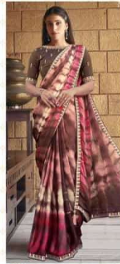
43013 FABRIC : CREPE GEORGETTE