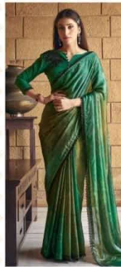
43009 FABRIC : SPARKING SATIN SILK