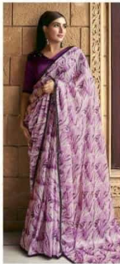
43004 FABRIC : SPARKING SATIN SILK