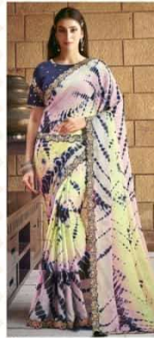
43012 Fabric : Satin Silk Georgette Accessorized with : A Designer Belt