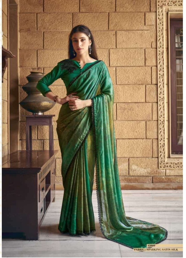
43809 FABRIC: SPARKING SATIN SILK