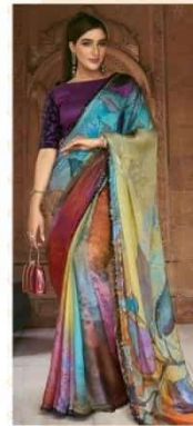
43011 FABRIC : SPARKING SATIN SILK