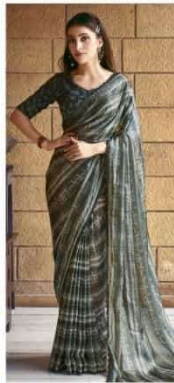
43005 FABRIC : SPARKING SATIN SILK