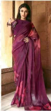
43006 FABRIC : SPARKING SATIN SILK CRUSH BLOUSE