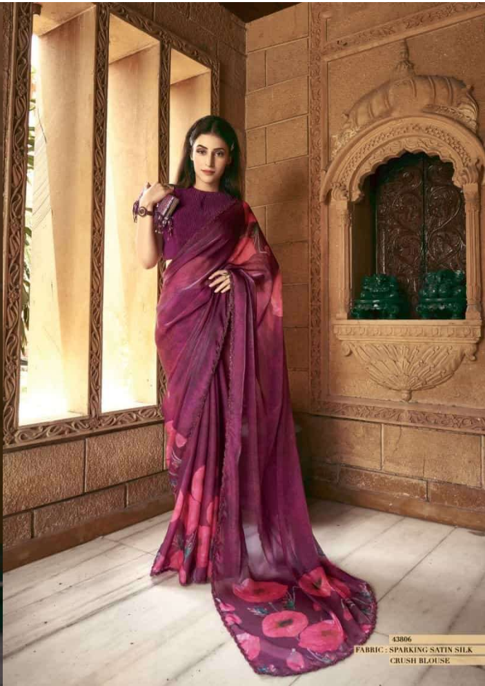
43806 FABRIC: SPARKING SATIN SILK CRUSH BLOUSE