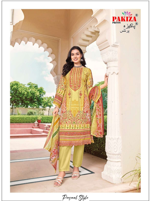
Personal Style ARHAM:4207