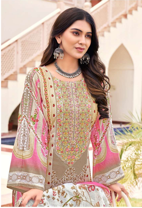
Personal Style ARHAM:4208