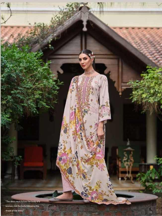
"The dress must follow the body of a woman, not the body following the shape of the dress."