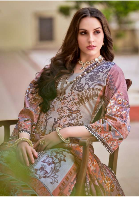
● 573-003 ●