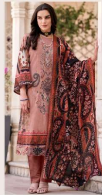
● 573-006 ●