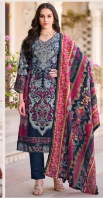
● 573-007 ●