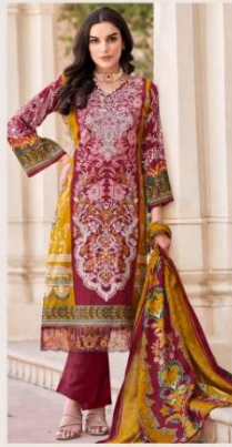
● 573-001 ●