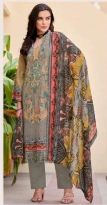
● 573-005 ●