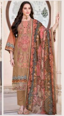
● 573-004 ●