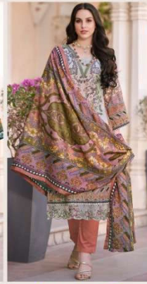
● 573-003 ●