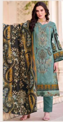
● 573-002 ●