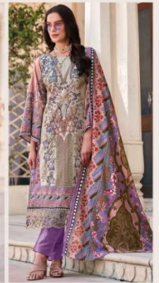
● 573-008 ●