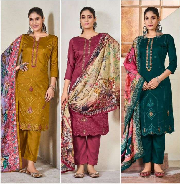
The art of STYLE 943-001