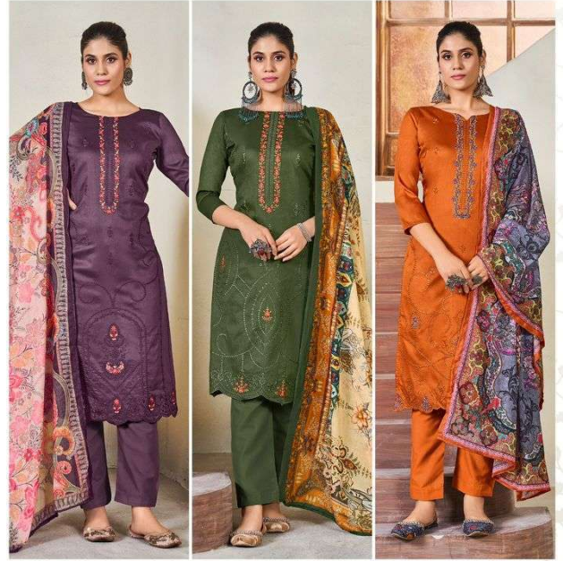
The art of STYLE 943-004