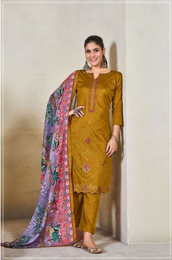
The art of STYLE 943-001