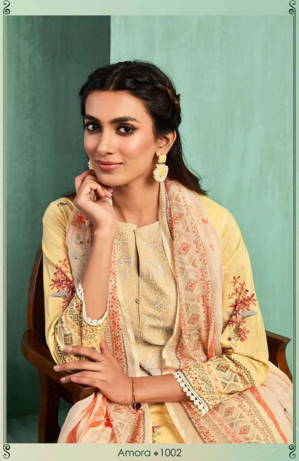
Amora ♦ 1002