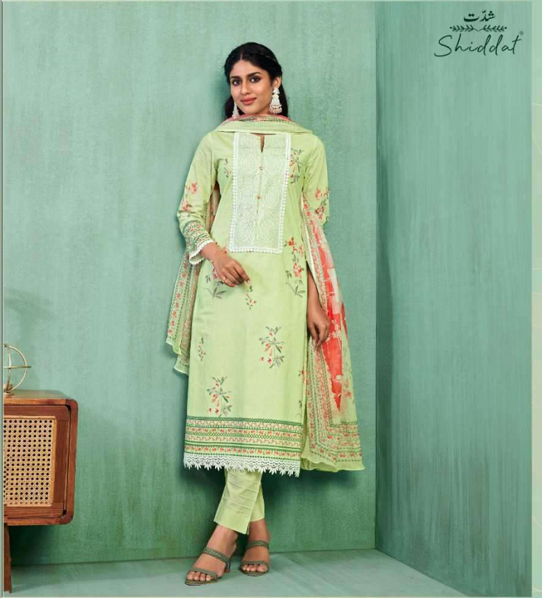
Amora ♦ 1003