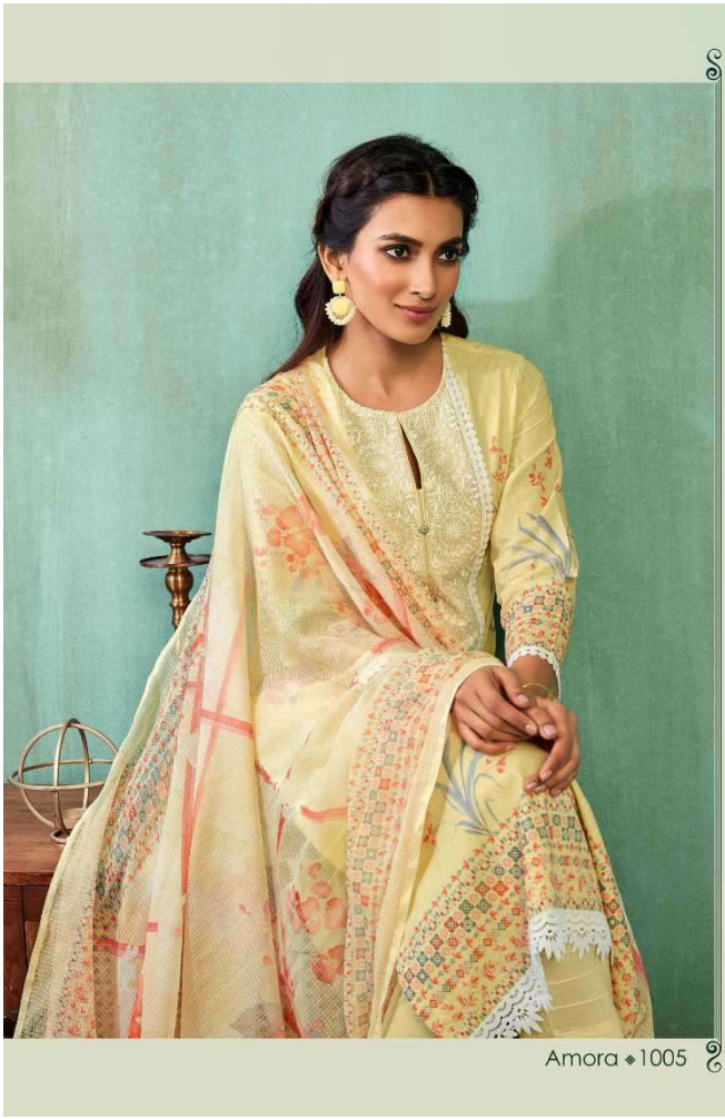
Amora ♦ 1005