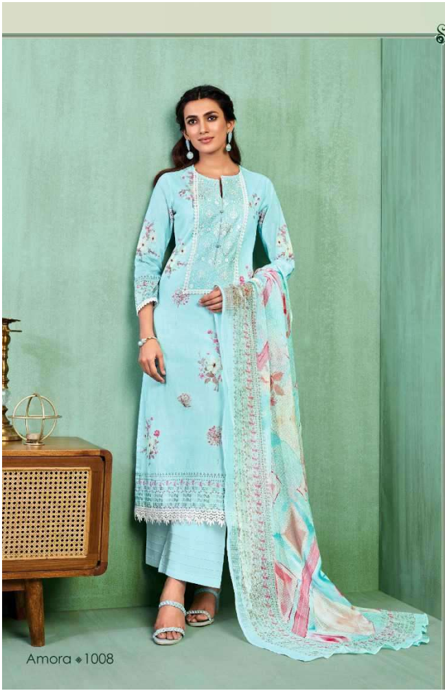
Amora ♦ 1008