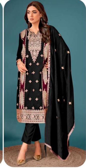
D.No | 294-D