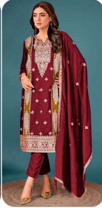
D.No | 294-B