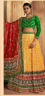
*** 2108 ***