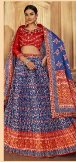
*** 2103 ***