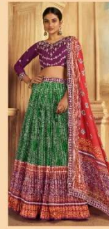
*** 2107 ***