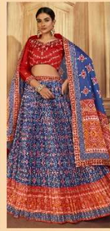
*** 2103 ***