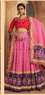
*** 2109 ***