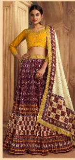
*** 2105 ***