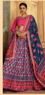
*** 2106 ***