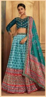
*** 2104 ***