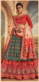
*** 2101 ***