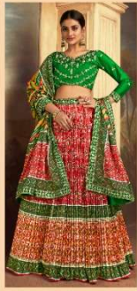
*** 2102 ***