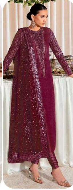
D.No | 295-D