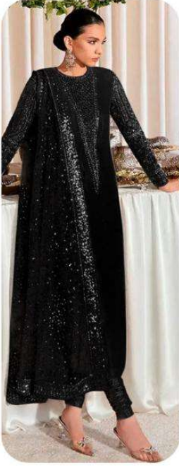
D.No | 295 A