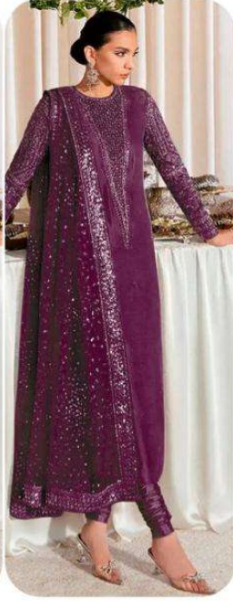
D.No | 295-B