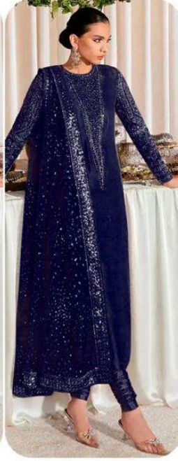
D.No | 295-C