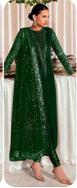
D.No | 295-D