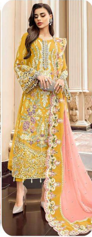
D.No | 277-C