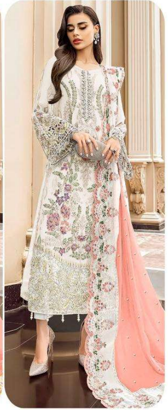
D.No | 277-D