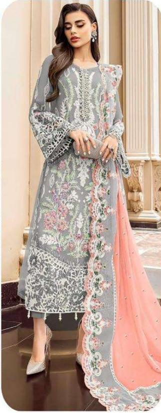
D.No | 277-B