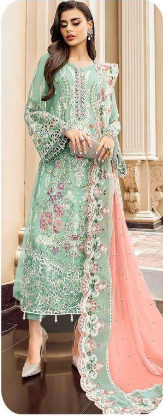
D.No | 277-A

TOP - Orgenza With Heavy Embroidery DUPATTA - Orgenza With Heavy Embroidery INNER - Santoon BOTTOM - Santoon