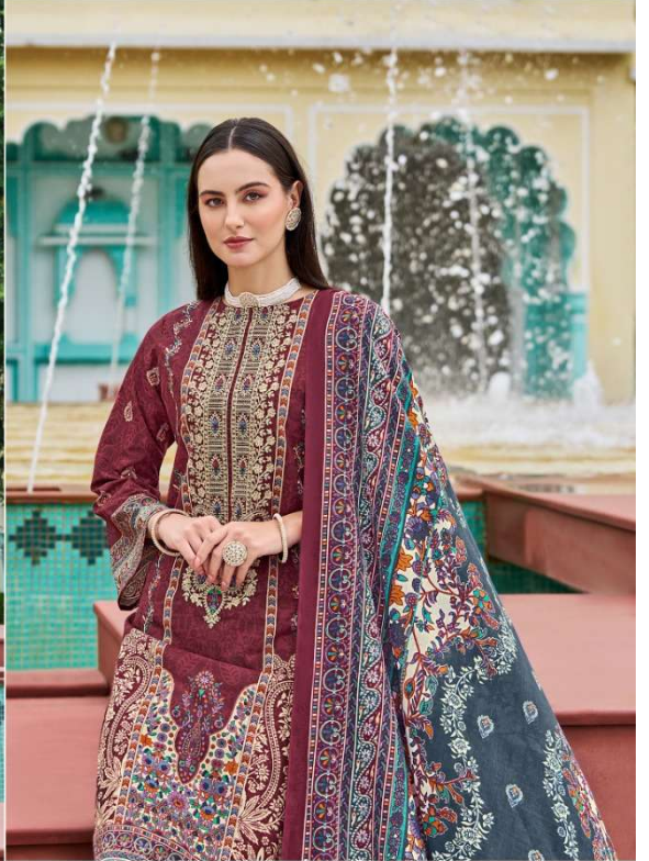
960-002 "Handy offers an alternate way of being, crossing and merging masculine and feminine."