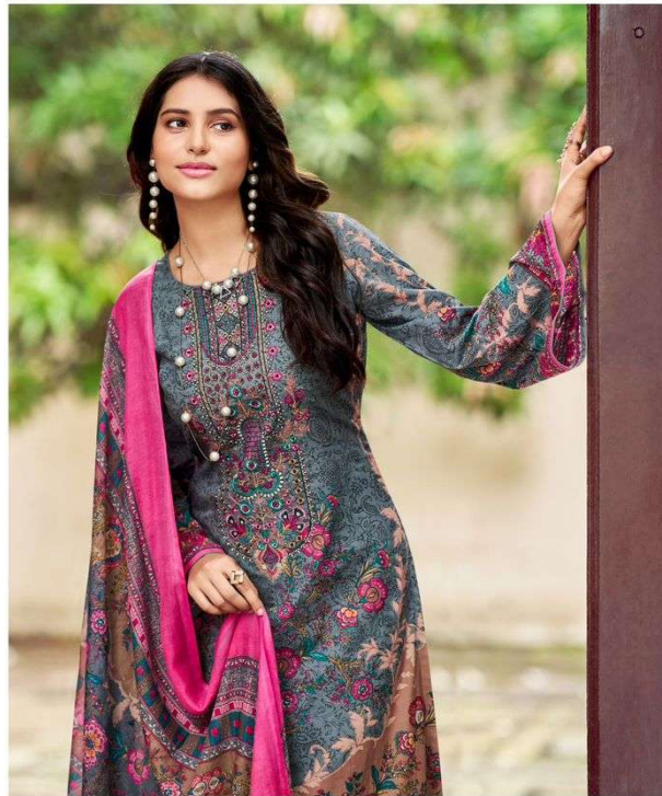
Fall in love with flawless finishing and textures that are sure to make heads turn.