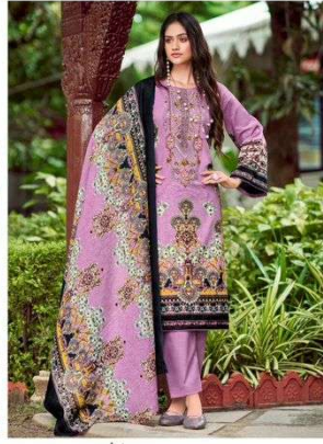
MUSAFIR | 19002 VOL-14