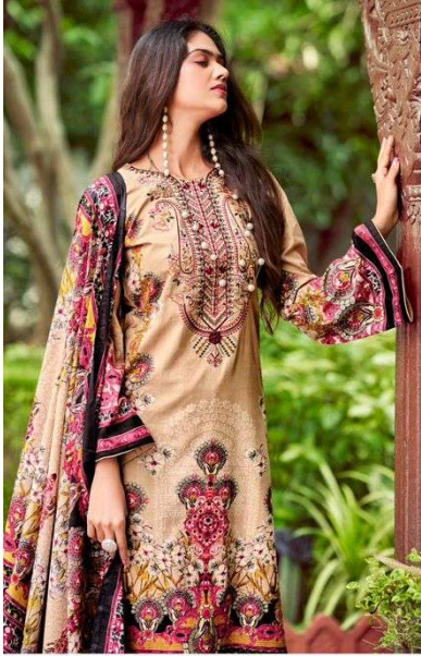
Mumtaz is a reflection of Ethnicity, it speaks about all things that are bright, happy, comfortable & festive.