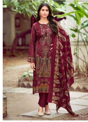
MUSAFIR | 19005 VOL-14