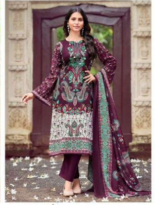
MUSAFIR | 19006 VOL-14