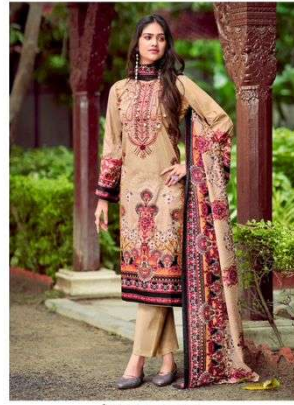
MUSAFIR | 19007 VOL-14