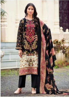
MUSAFIR | 19001 VOL-14