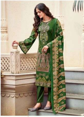
MUSAFIR | 19003 VOL-14