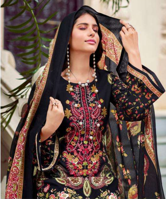
Evoke the Indian ethos in your style with Mumtaz.

ریاضت آرٹس RIAZ ARTS The Luxury Lane MUSAFIR | 19001