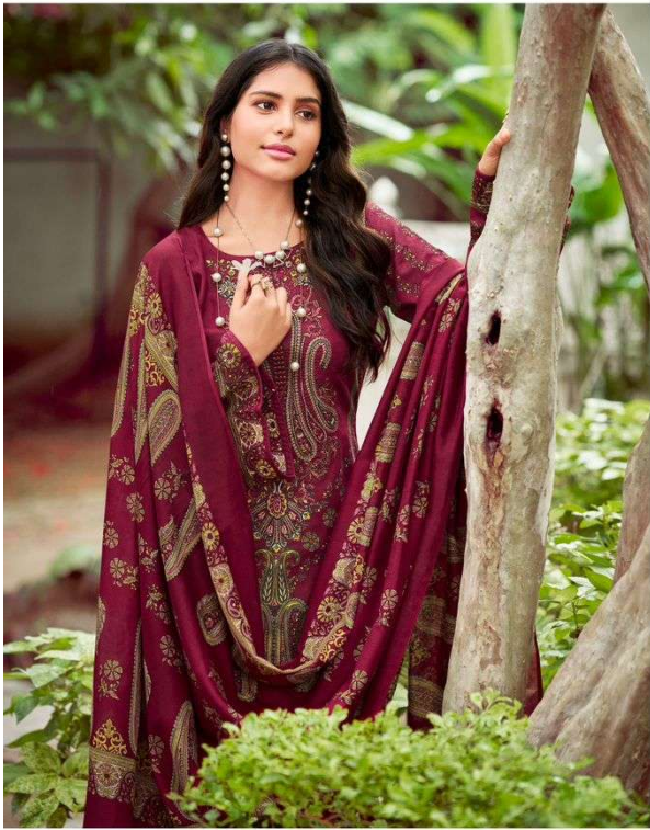
Showing an unpamphlet collection of season's best fashion trends!

ریاض آرٹس RIAZ ARTS The Luxury Lane میں مسافر | 19005