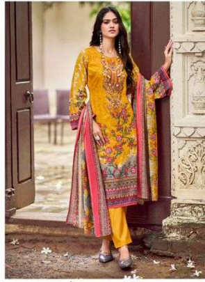
MUSAFIR | 19004 VOL-14