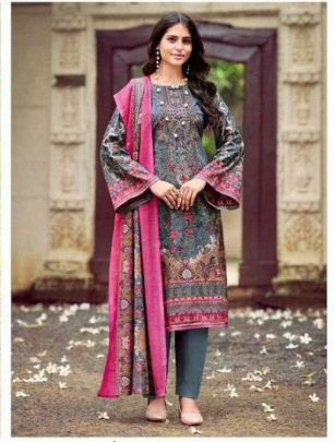
MUSAFIR | 19008 VOL-14