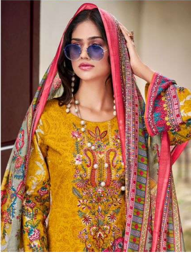
Redefining elegance with class, it's all about comfort and versatility.