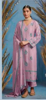
• 2113 •