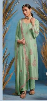
• 2115 •