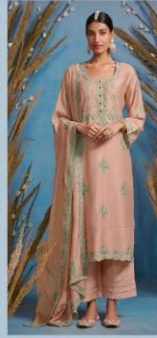
• 2114 •