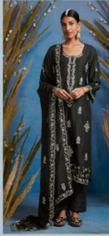
• 2112 •