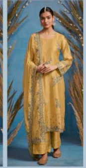
• 2118 •