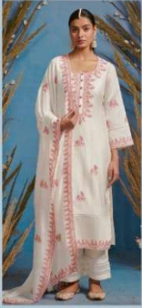
• 2111 •