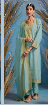
• 2117 •