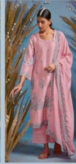
• 2116 •