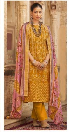
▪ 74006 ▪