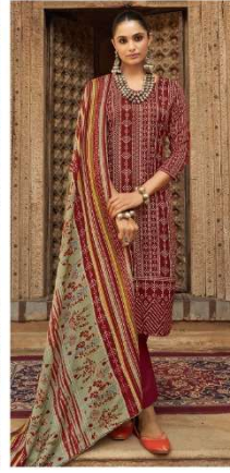
▪ 74002 ▪