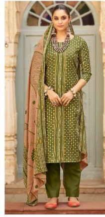
▪ 74005 ▪