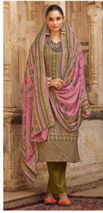
▪ 74004 ▪