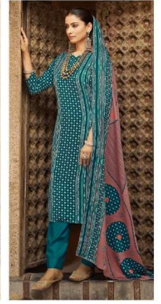
▪ 74003 ▪