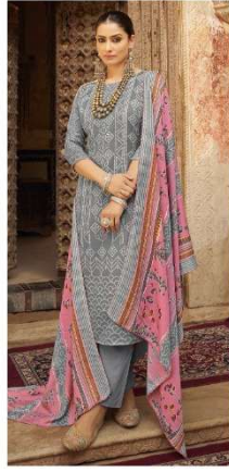
▪ 74001 ▪