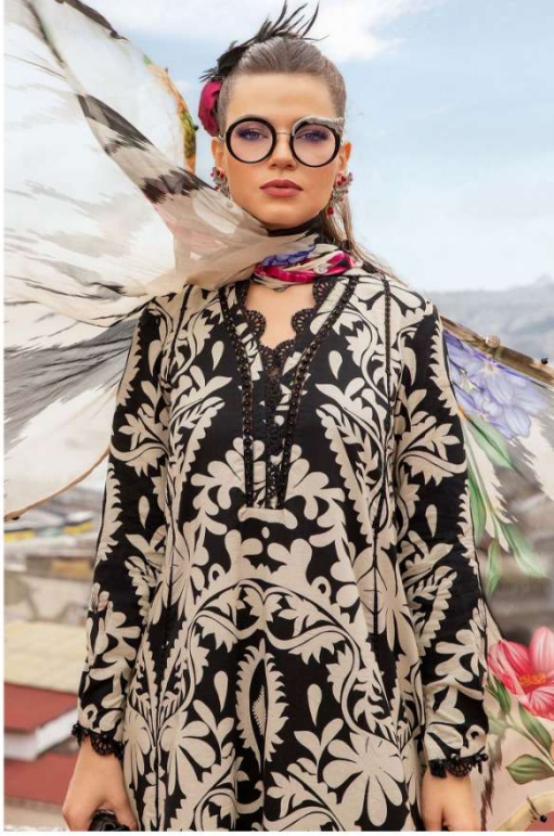
16002 A M PRINT-16