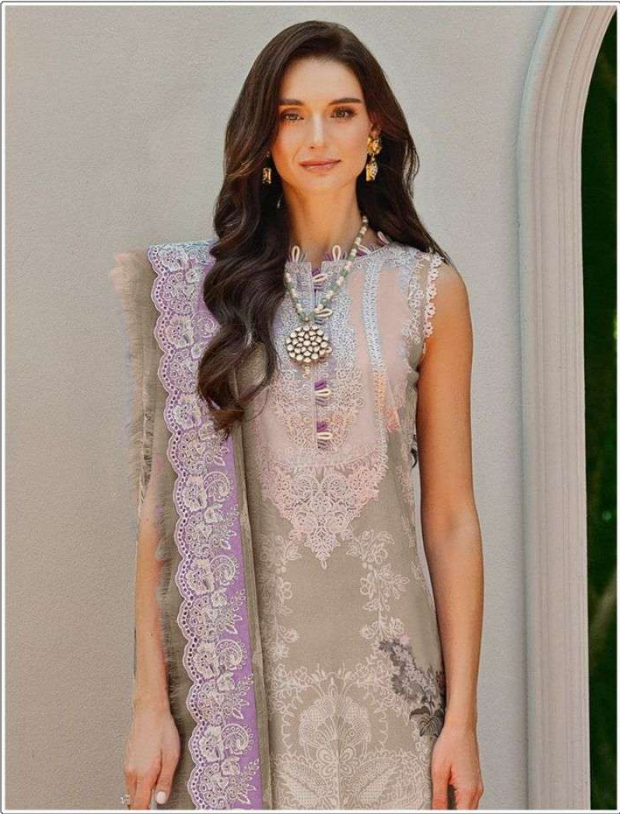
D.No:- 1019 B