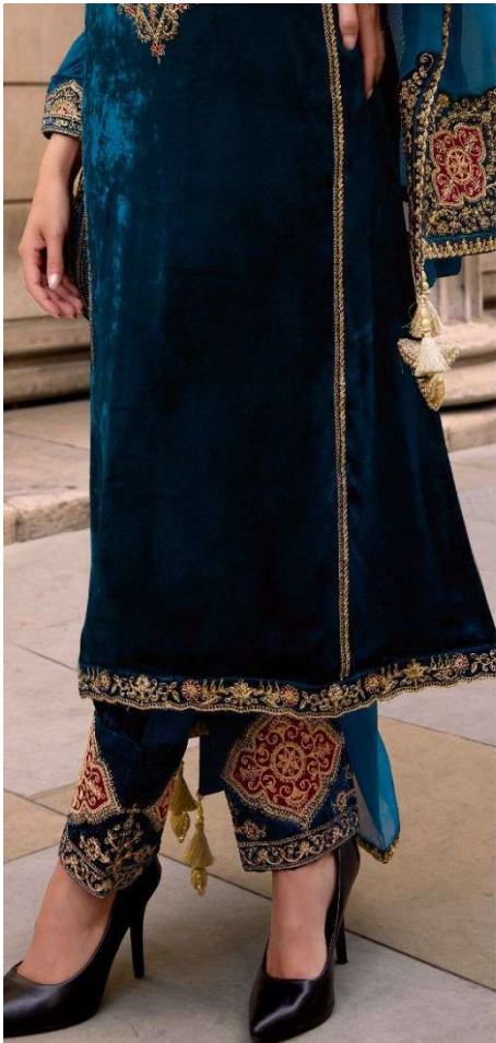
There's something magical about the way a fabric can move on her