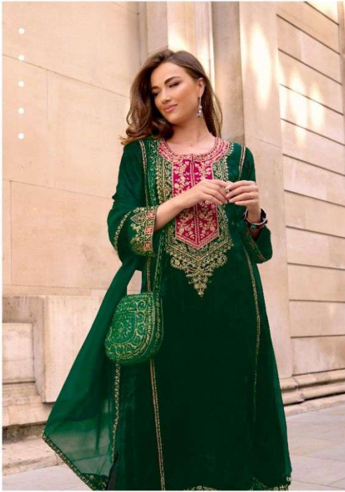
India Pakistan Salwar Kameez and Kurta are all the vogueformats get elegant and easy to wear. Designer Kurta, Salwar Kameez and Chariz are the latest trend in women fashion, some are embellished with gorgeous embroidery work in pleasing designs. They manage to look smart enough to be worn for casual family gatherings, or even for a wedding ceremony.