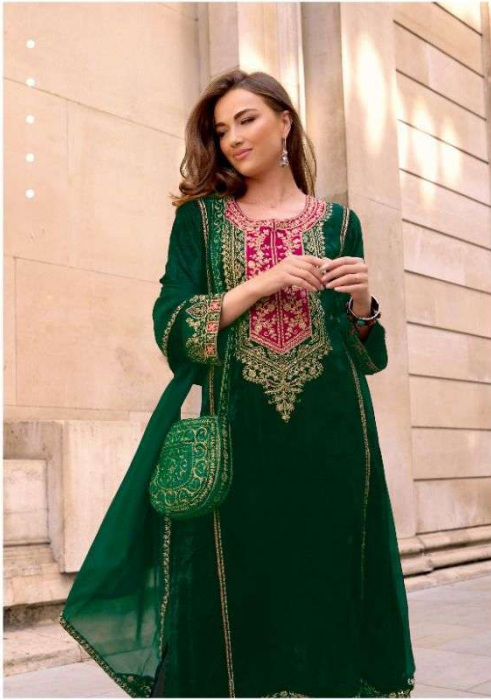
India Pakistan Salwar Kameez and Kurta are all the vogueformats get elegant and easy to wear. Designer Kurta, Salwar Kameez and Charidar are the latest trend in Indian fashion, some are embellished with gorgeous embroidery work in pleasing designs. They manage to look smart enough to be worn for casual family gatherings, or even for a wedding ceremony.