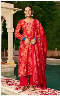
• 3005 • ◆◆◆◆◆