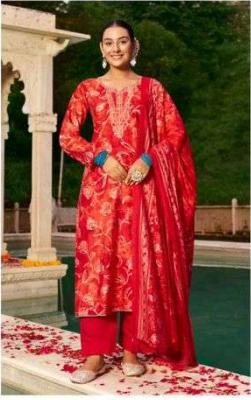
• 3005 • ◆◆◆◆◆