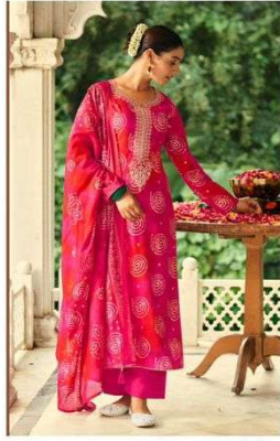
• 3002 • ◆◆◆◆◆