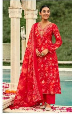
• 3003 • ◆◆◆◆◆