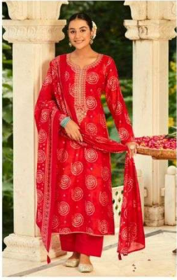
• 3001 • ◆◆◆◆◆