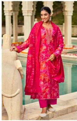
• 3006 • ◆◆◆◆◆