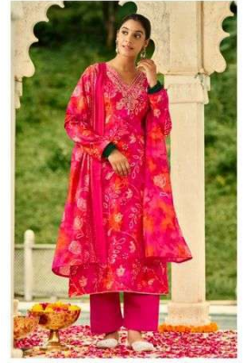
• 3004 • ◆◆◆◆◆