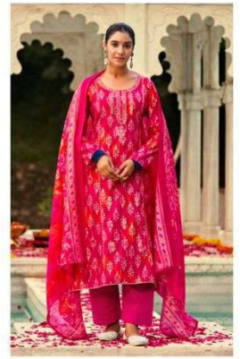
• 3008 • ◆◆◆◆◆