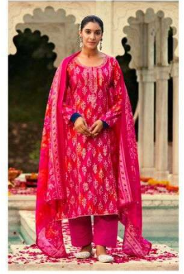
• 3008 • ◆◆◆◆◆