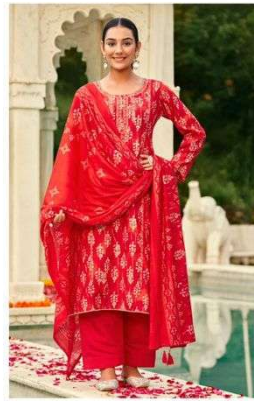
• 3007 • ◆◆◆◆◆