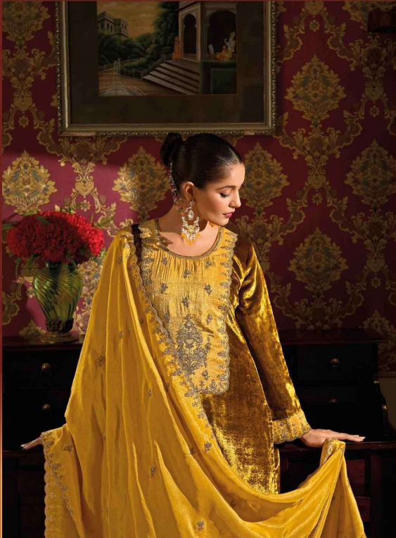
Clamour Fashion is the pursuit of the beautiful