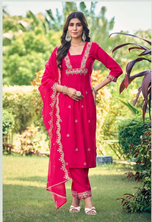
▪ | 2004 | ▪