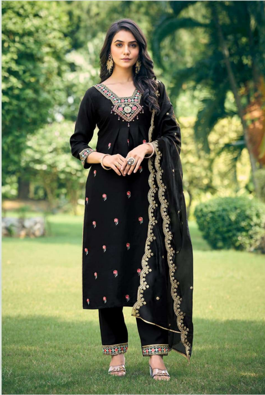
▪ | 2001 | ▪