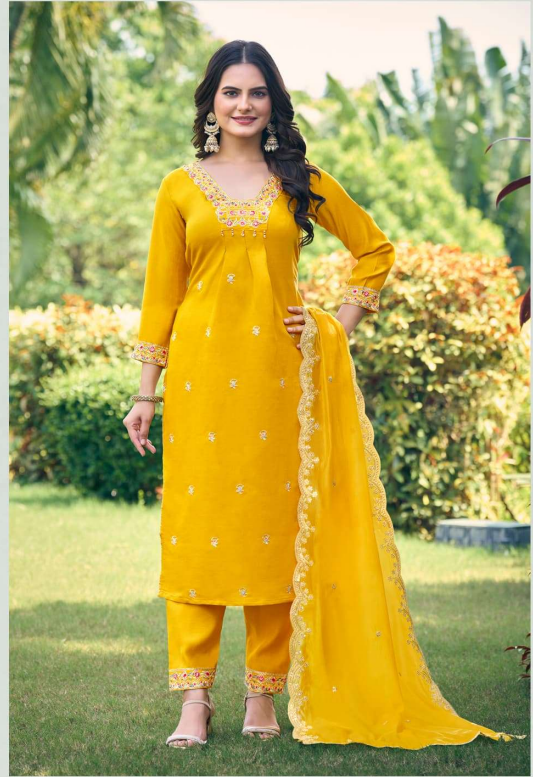
▪ | 2002 | ▪