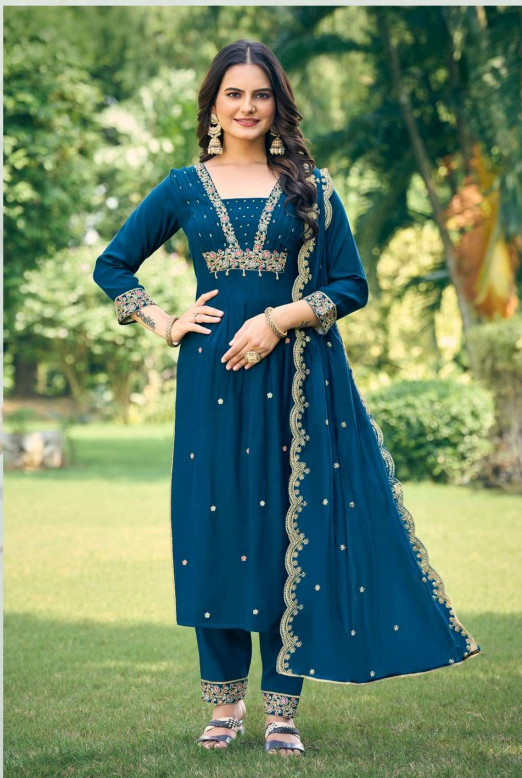
▪ | 2003 | ▪