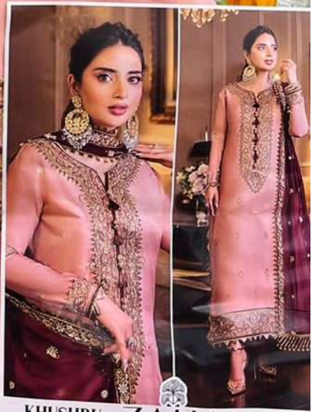
KHUSHBU Vol-4 TOP Faux Georgette with Embroidery ZAHA 10136 BOTTOM-INNER Dull Satin