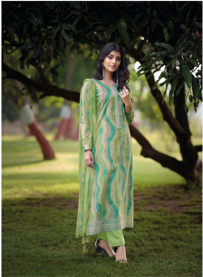
652 CREATE MEMORIES WITH DELICIOUS ACCESSORY