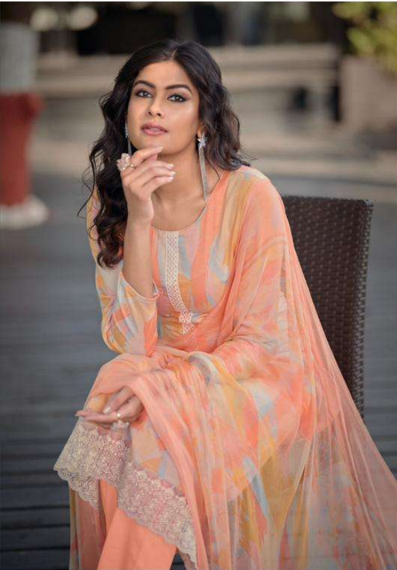
A CLASSIC ACCESSORY THAT NEVER GOES OUT OF FASHION