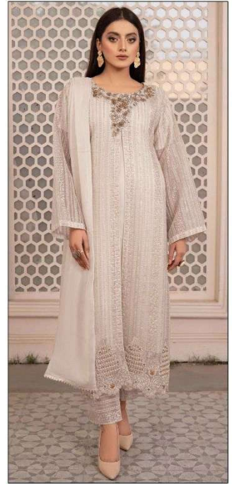
S - 122 F