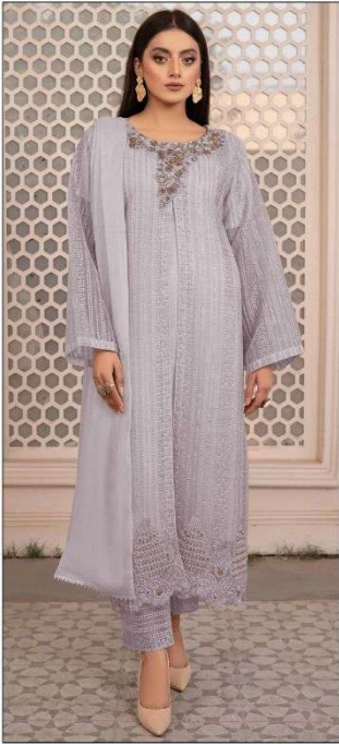
S - 122 C

TOP - FOX GEORGETTE HEAVY EMBROIDERED WITH NECK PATCH MOTI WORK BOTTOM / INNER - HEAVY SANTOON AND EMB. BOTTOM PATCH DUPATTA - NAZNIN FOUR SIDE LACE