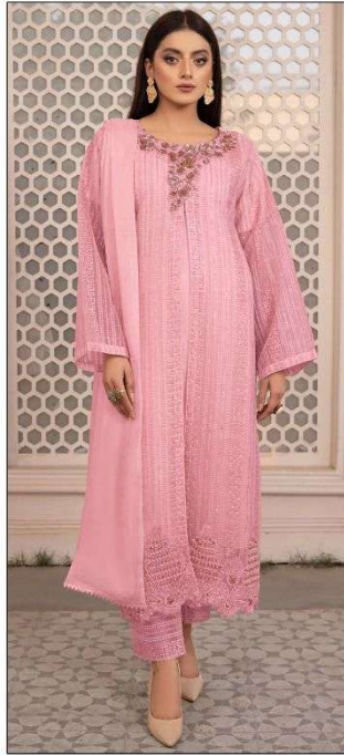
S - 122 E