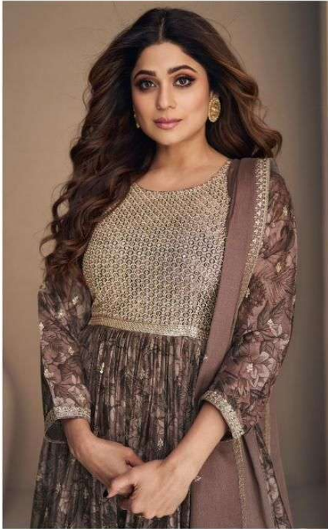
A - 9560