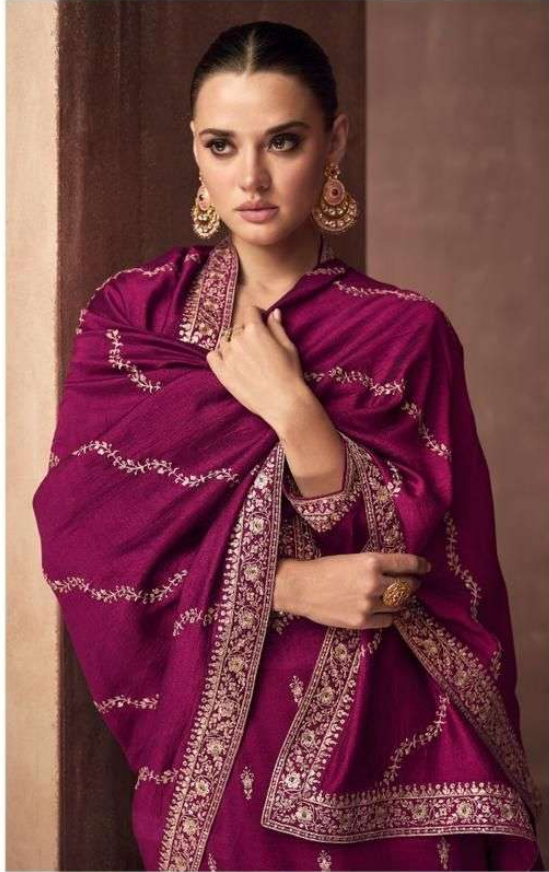
A - 9582