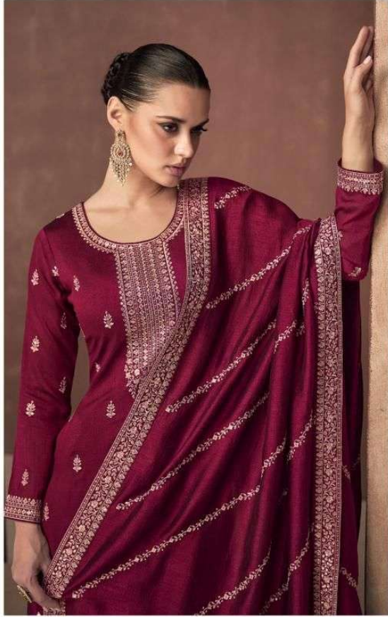
A - 9586