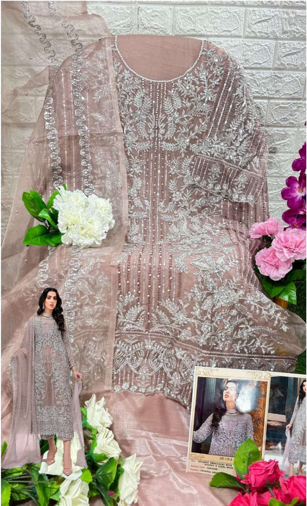
DS-178-A ORANGE EMBROIDERY WITH ATLAS & PEARL WORK Bottom / Size: FANTOM Kapatid: BANGKAY KINO