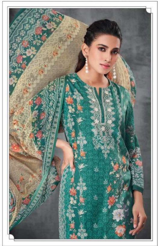
Florina # 1006