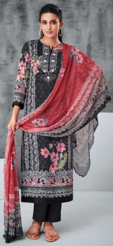
Florina # 1004