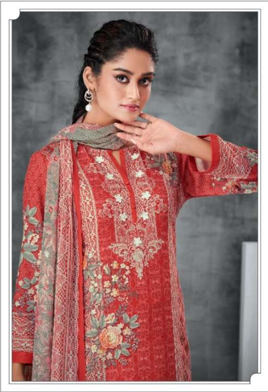
Florina # 1001