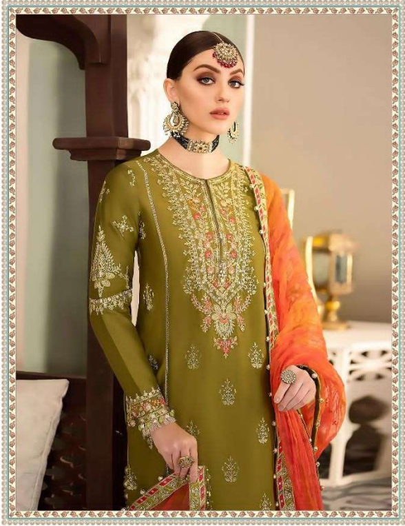
MARIYA B EMBROIDERED FESTIVAL COLLECTION VOL-1