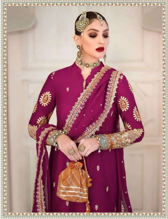
MARIYA B EMBROIDERED FESTIVAL COLLECTION VOL-1