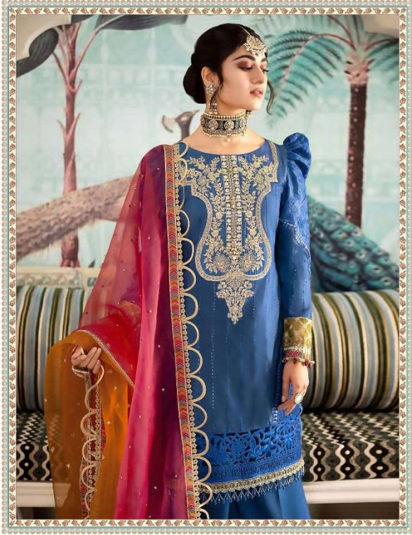
MARIYA B EMBROIDERED FESTIVAL COLLECTION VOL-1