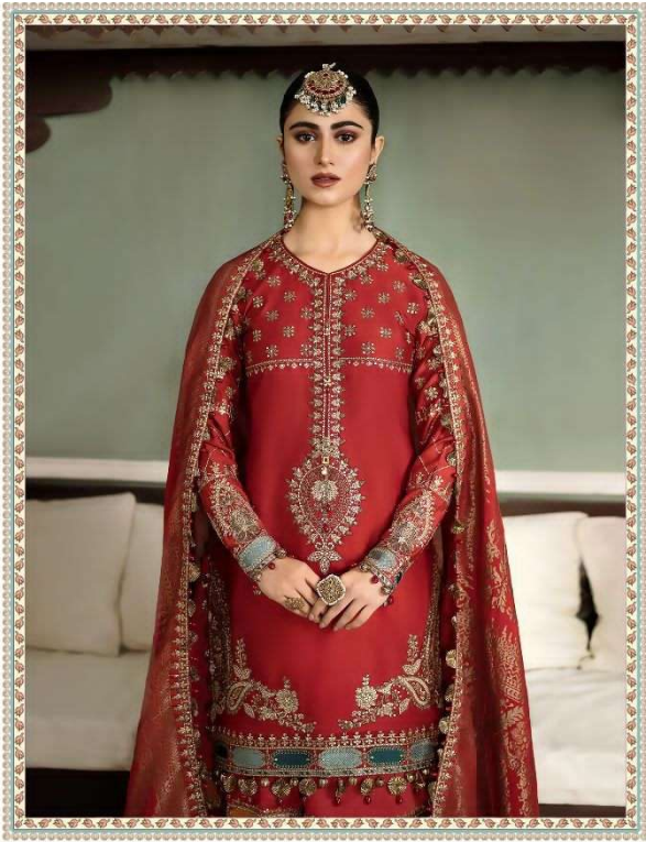
MARIYA B EMBROIDERED FESTIVAL COLLECTION VOL-1