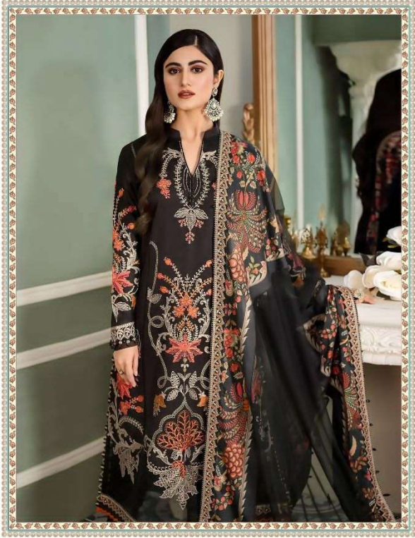
MARIYA B EMBROIDERED FESTIVAL COLLECTION VOL-1