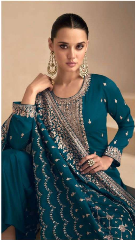
A - 9571