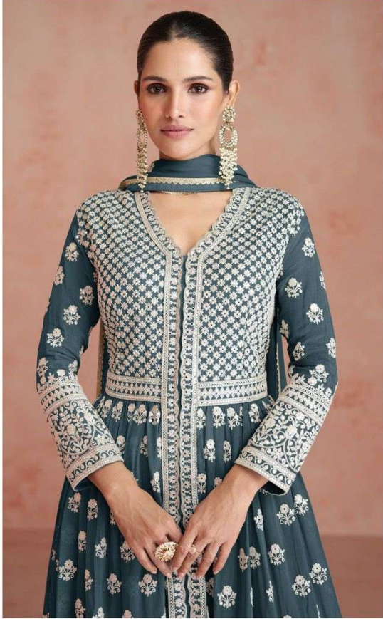
A - 9601