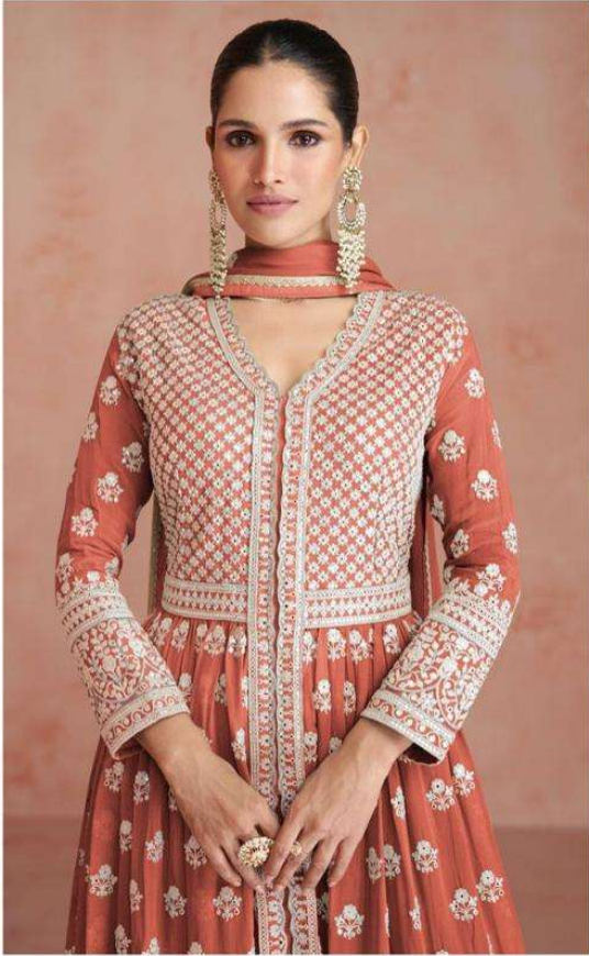
A | - 9599