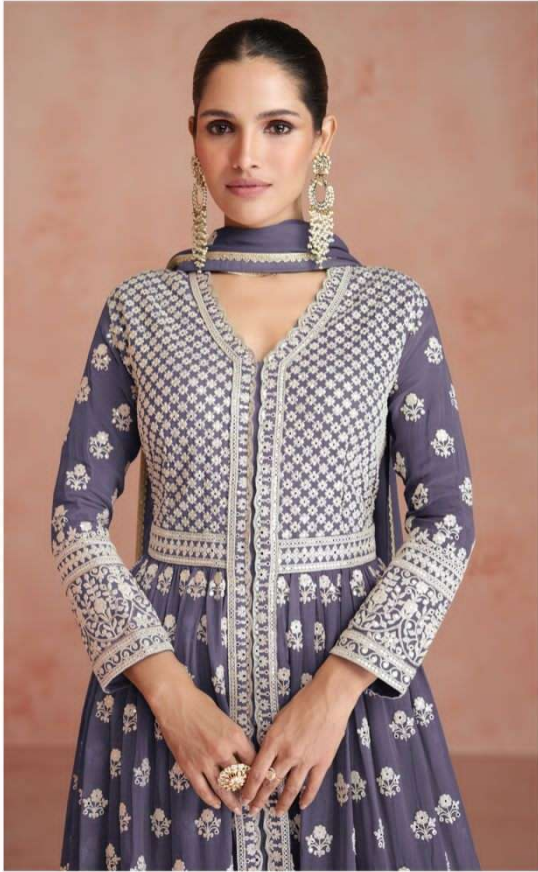
A - 9597