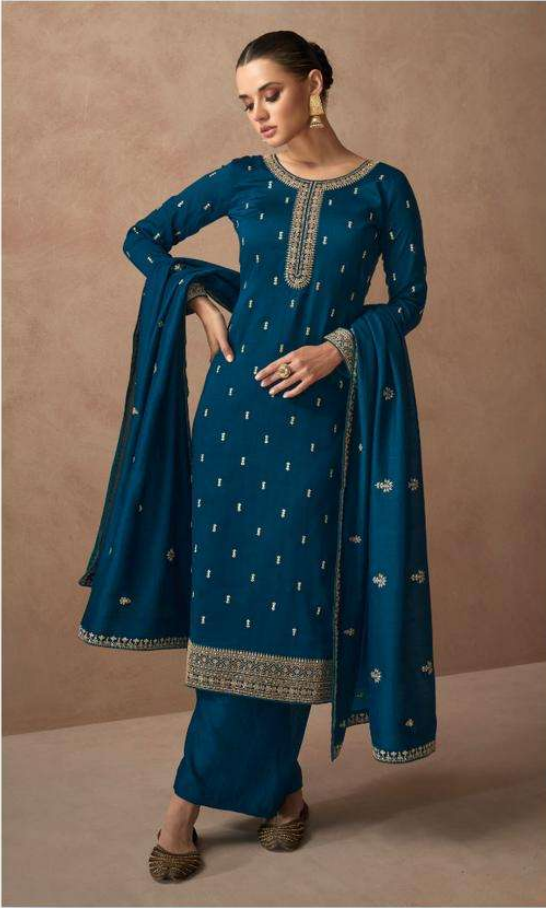
A - 9565