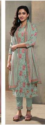
D NO: 4 2 7