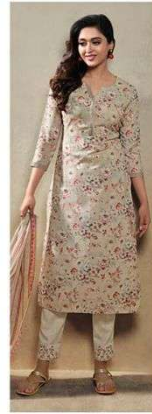
D NO: 4 2 3