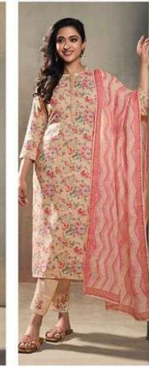
D NO: 4 2 8