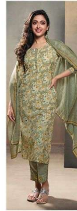
D NO: 4 2 5