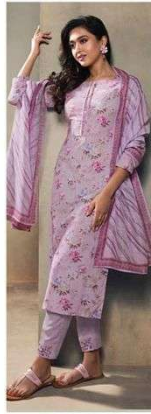
D NO: 4 2 2