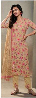
D NO: 4 2 1