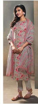
D NO: 4 2 4