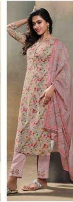
D NO: 4 2 6