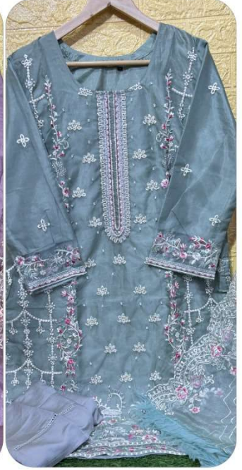
D.No | 205-D