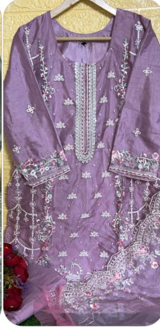
D.No | 205-C