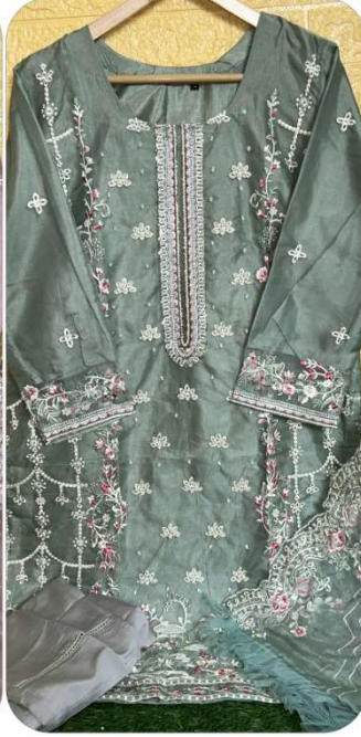
D.No | 205-B