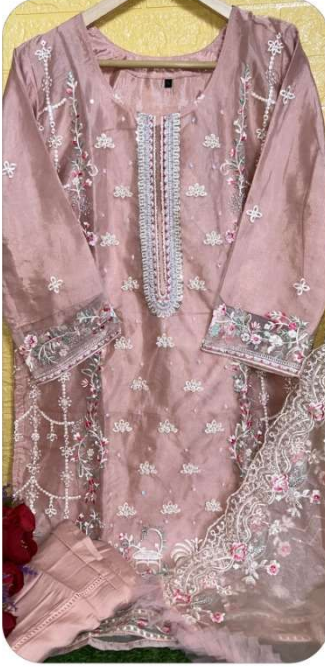
D.No | 205-A