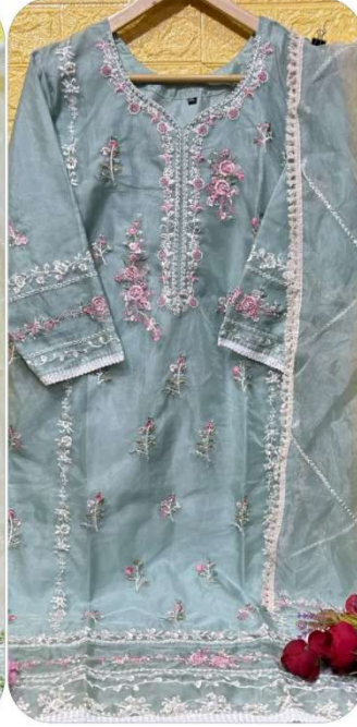
D.No | 207-B