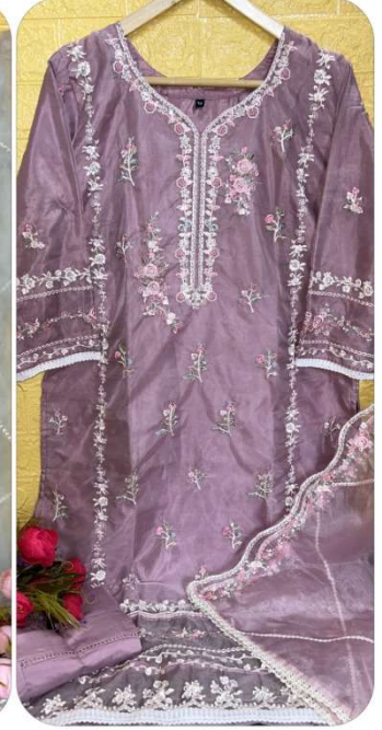
D.No | 207-D