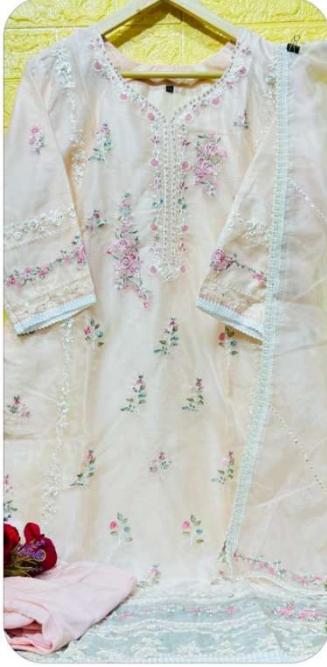
D.No | 207-A

DUPATTA --ORGANZA WITH HEAVY EMBROIDERY WITH FRILL