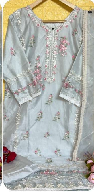
D.No | 207-C