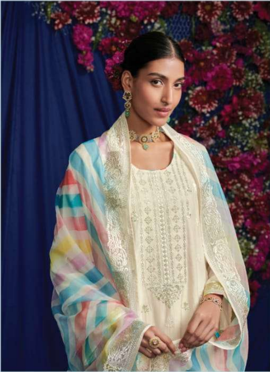
JUGMUG • 8995