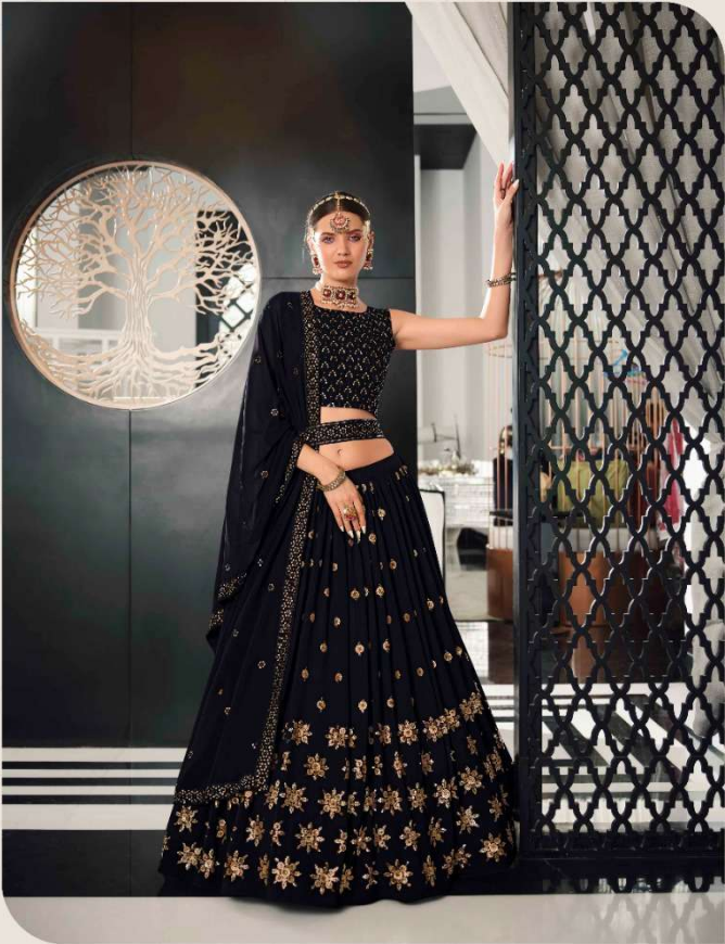
Popping up bright hues on an every palette with a smattering of delicate floral motifs - it's just the un-maintained charm.