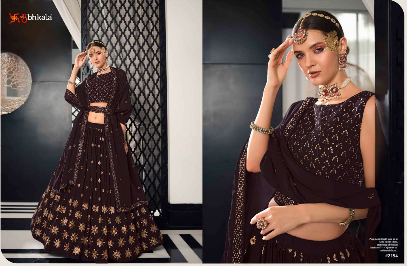
Popping up bright here on an inky palette with a smattering of delicate floral motifs - it's just the on traditional theme.