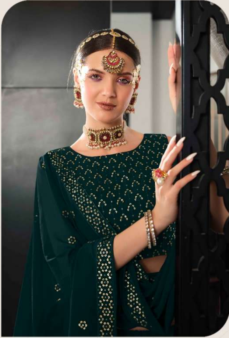
Popping up bright hues on moody palette with a smattering of delicate floral motifs - it's just the on traditional charm. #2156