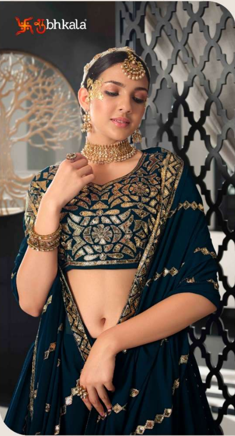
Popping up bright hues on an every palette with a constellation of delicate floral motifs – it's just the way traditional shaw.