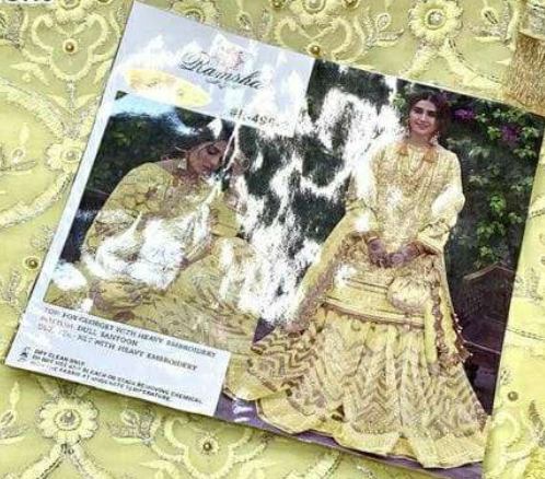
Emb Net Bottom