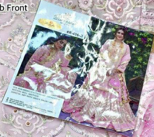
Emb Net Bottom