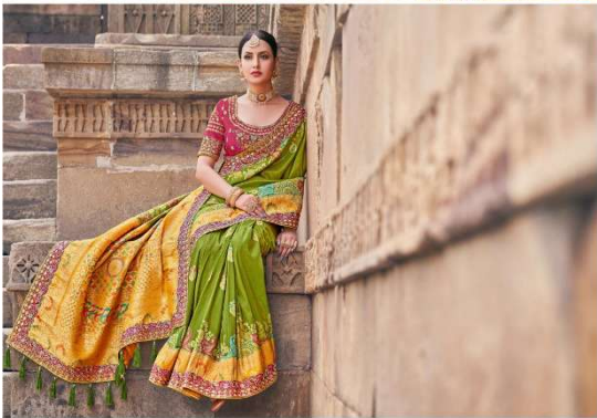
Saree is a power suit. You walk into a room wearing a saree and you know what the room are talking about. It's a "co-psychic" thing.