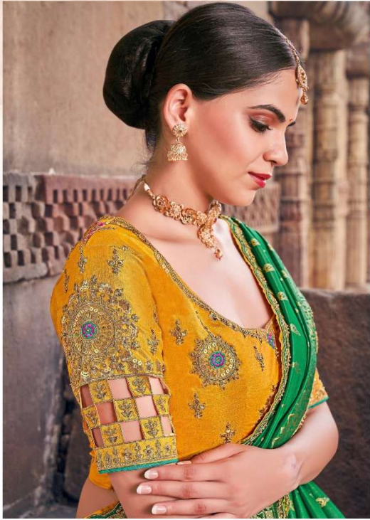
Saree is a wonderful garment that elegantly flatters the curves of a woman.