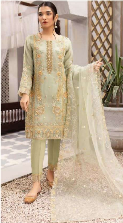
P - 10004-A

TOP - ORGENZA WITH EMBROIDERY WITH KHALTI WORK BOTTOM / INNER - SANTOON DUPATTA - ORGENZA WITH EMBROIDERY