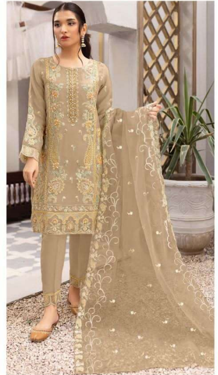
P - 10004-C