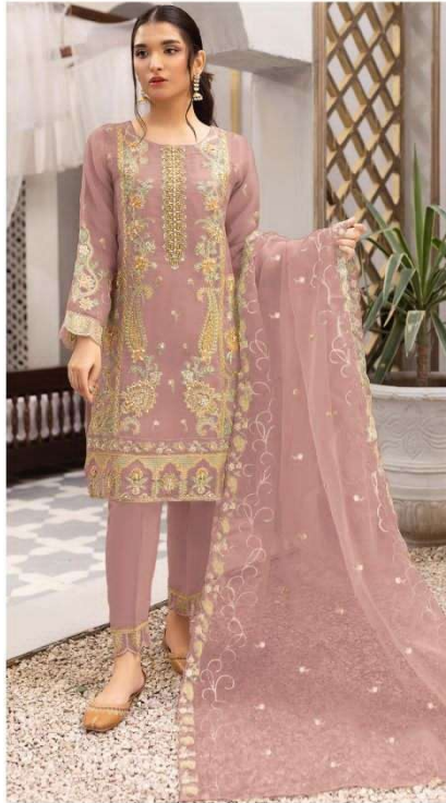
P - 10004-B