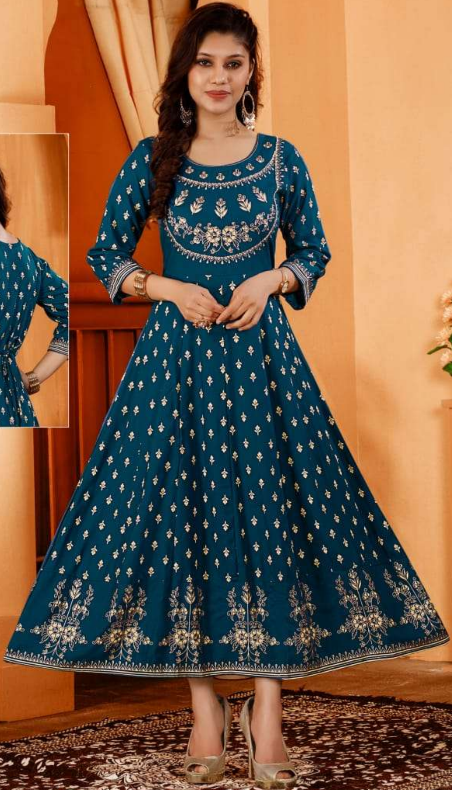
KHATTI METTI 105