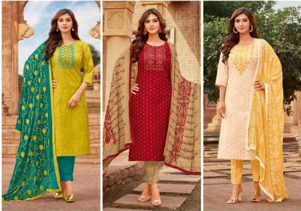
62004 ເຊັກຊັມ 62005 ເຊັກຊັມ 62006 ເຊັກຊັມ