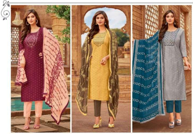
62001 ເຊັກຊັມ 62002 ເຊັກຊັມ 62003 ເຊັກຊັມ